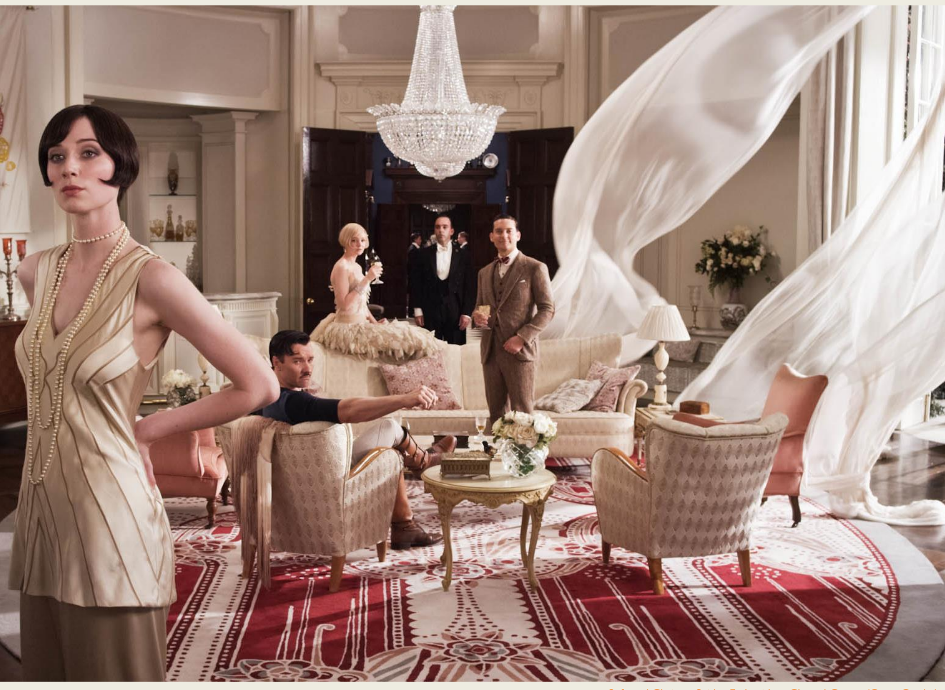
Sofa and Chairs – Spider Embroidery Clotted Cream (Great Gatsby)